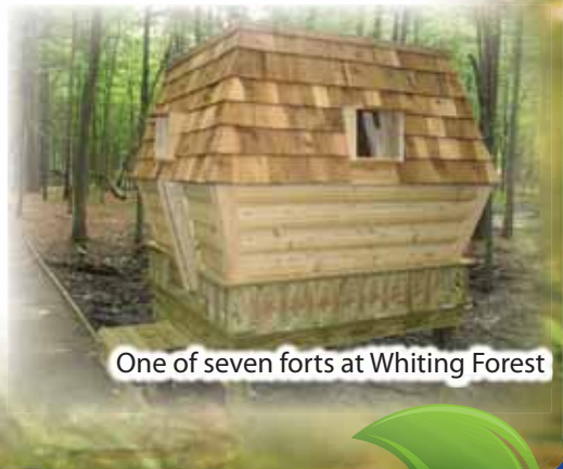
One of seven forts at Whiting Forest

Kid's club members must be accompanied by an adult during their visit to Whiting Forest.